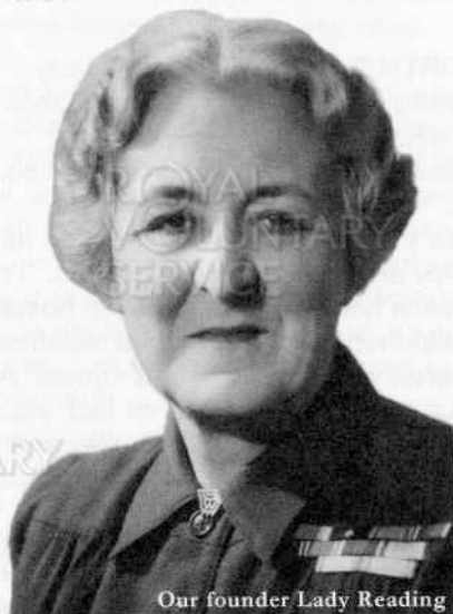
Our founder Lady Reading